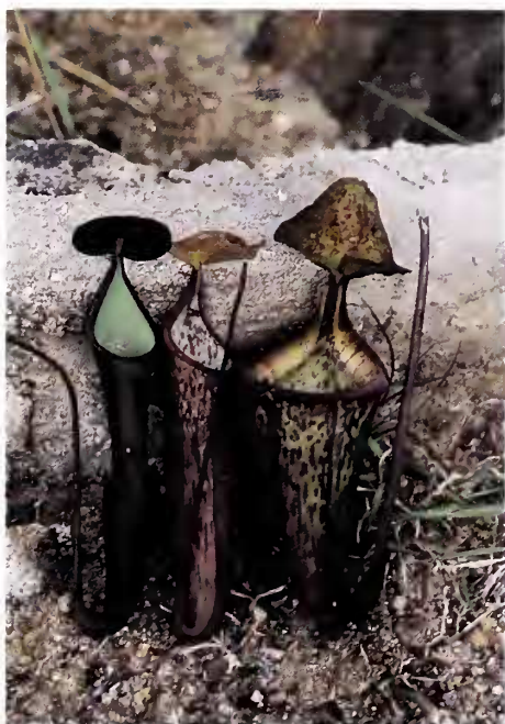
N. gracillima (left) N. gracillima x N. macfarlanei (middle) N. macfarlanei (right)